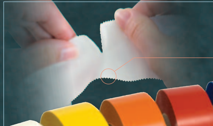
Serrated "PINKED" edge available

Our series of Polyethylene Tapes offer a very aggressive adhesive on a thick water-proof polyethylene film carrier. These tapes are great for sealing and hanging polyethylene sheeting as well as seaming sheets together. It is also a common product for use in vapor barrier installations. Excellent choice for use in isolating dissimilar metals, bundling and protective packaging applications. This tape is great for palletizing heavy loads due to its strength and conformability. Tape is available in assortment of colours and thicknesses. All tapes can be special ordered with a serrated "pinked" edge to aid in easy tearing, even with gloves on. Speak to your sales representative for a cross reference to other company tape products.