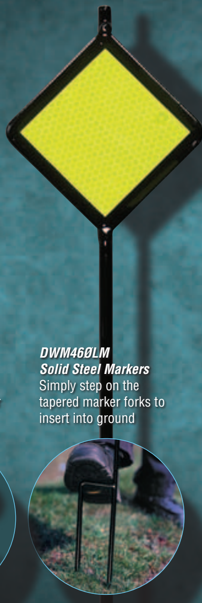
DWM460LM Solid Steel Markers Simply step on the tapered marker forks to insert into ground